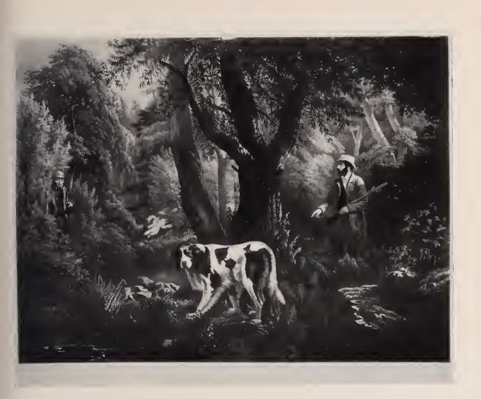
WOODCOCK SHOOTING [NUMBER 293]